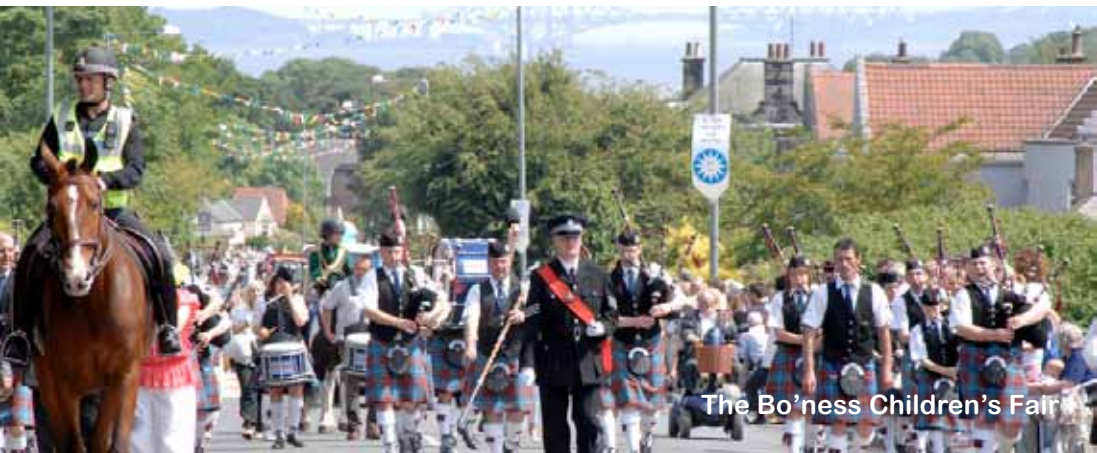
The Bo'ness Children's Fair

The Falkirk area is part of The Forth Valley, which also covers Stirling and Clackmannanshire. The Forth Valley What to See and Do guide is available at VisitScotland Information Centres or tel: 01324 620244.