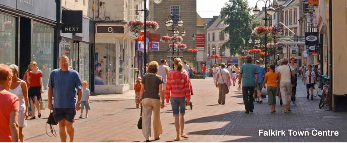
Falkirk Town Centre