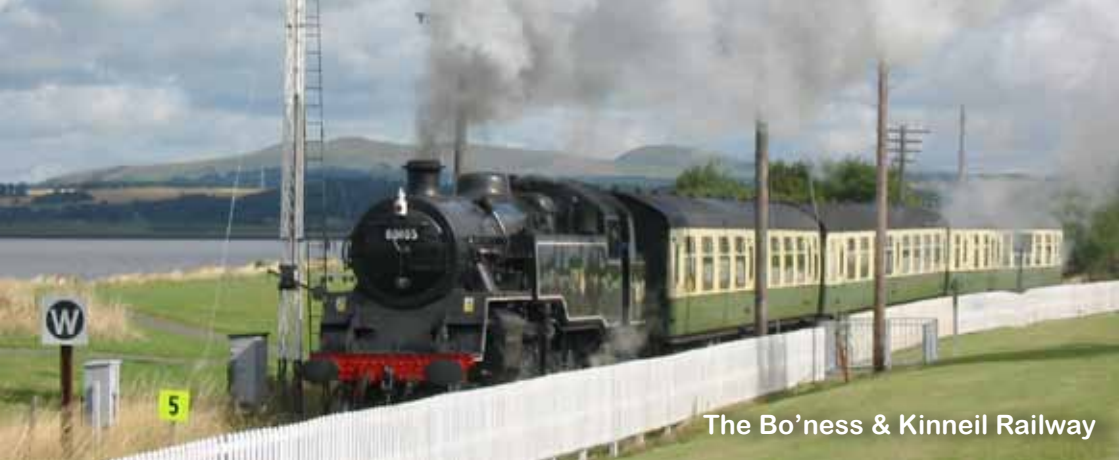
The Bo'ness & Kinneil Railway