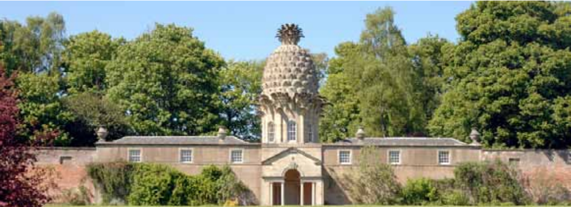
The Dunmore Pineapple